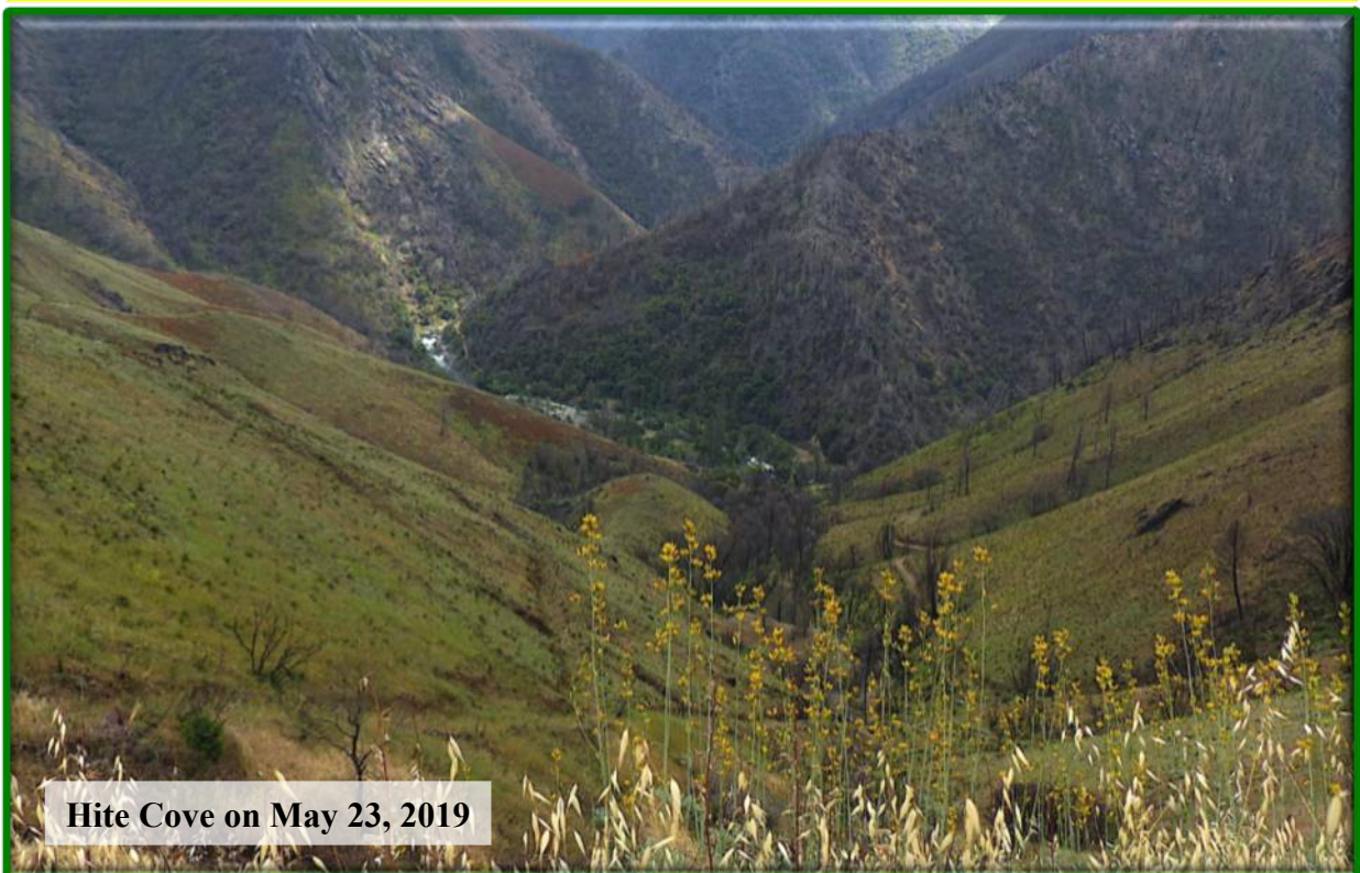
Hite Cove on May 23, 2019