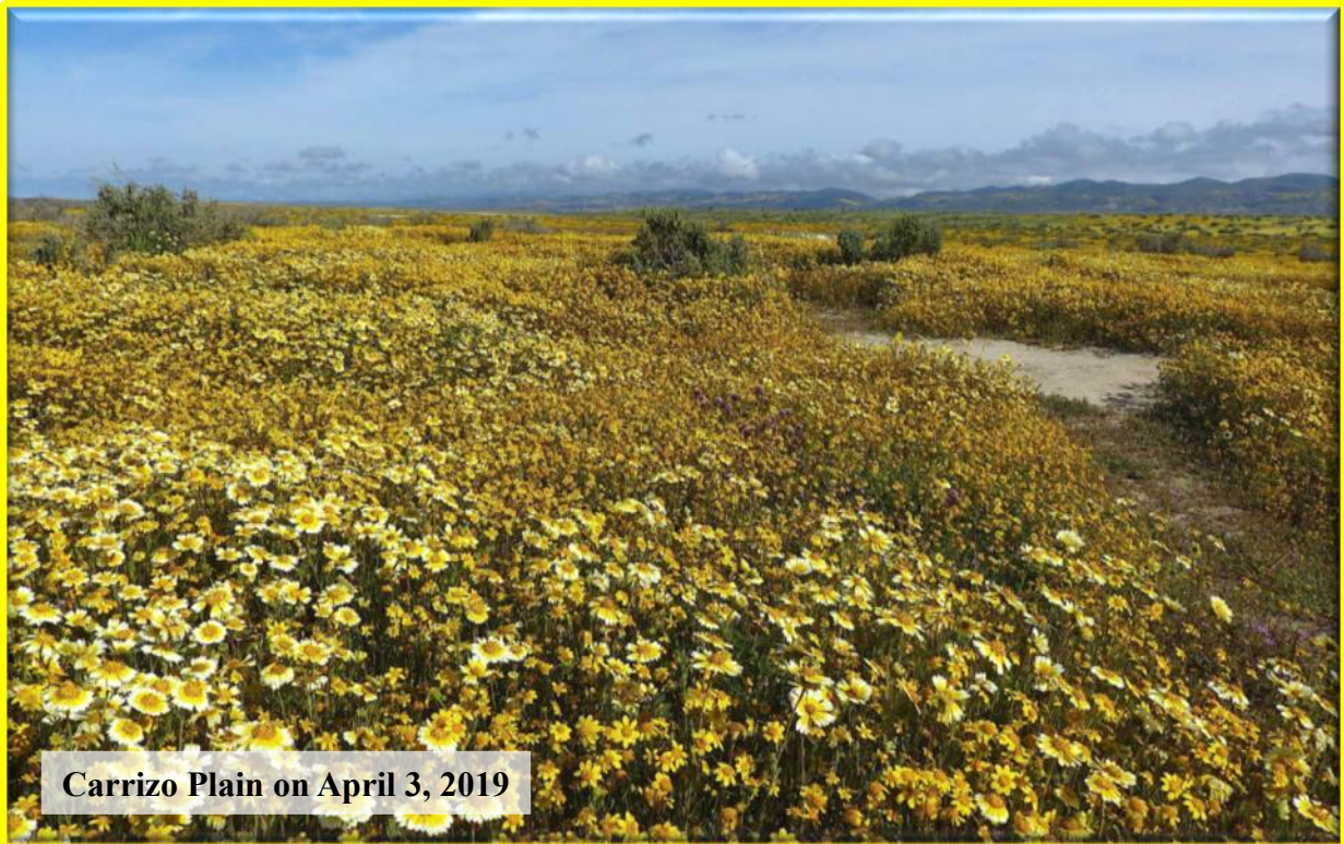
Carrizo Plain on April 3, 2019

This, of course, is a trick question. The top picture contains vastly more individual wildflowers ; but the bottom picture contains many more wildflower species . In three days of fairly intense botanizing at Carrizo, from the lowest to highest elevations, I was able to identify 58x species in bloom. In the Hite Cove zone, I identified 100x species in one day. There is no “right way” to appreciate wildflowers. Some people delight in dense displays, even if few species are represented. Others (like me) prefer the smorgasbord – many choices & small portions. The second Hite Cove field trip, scheduled for May 10, will let you sample one of the best smorgasbords in our chapter area. – Editor