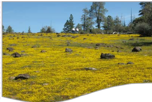
Abernathy Lava Cap Field Trip, 2010