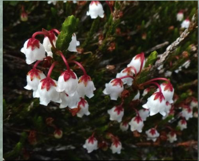
Figure 3. Cassiope at Hall Natural Area (see Page 2 for article).