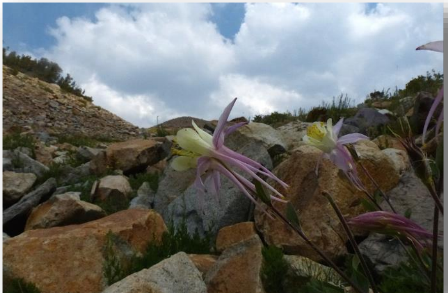
Figure 1. Alpine Columbine below Dana Plateau.

Everyone probably knows that Cassiope mertensiana was John Muir's favorite wildflower. If I had to name my Top 4 High Sierra wildflowers, I would name Sky Pilot #1; Alpine Columbine #2; Cassiope #3; Rock Fringe #4. On August 29-30, I took two walks: one from Tioga Lake to the Dana Plateau, another from Sawmill Campground into the Hall Natural Area. I didn't get high enough to see Sky Pilot, but I saw huge numbers of Alpine Columbine and Rock Fringe just below the Dana Plateau; and a beautiful patch of Cassiope in the Hall Natural Area (Figs. 1-3).