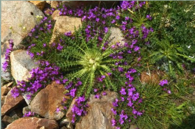
Figure 2. Rock Fringe just below Dana Plateau (see Page 2 for article).