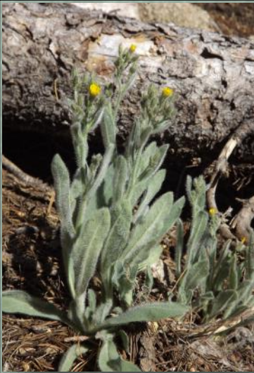
Shaggy hawkhead ( Hieracium horridum ), Kinney Lake Field Trip.