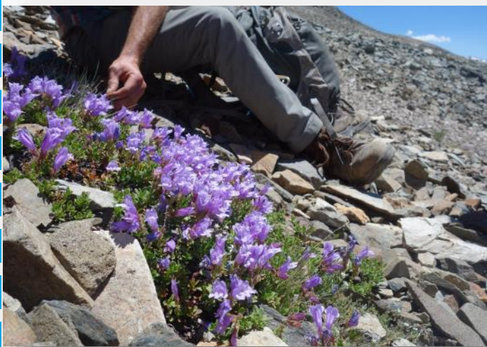
Davidson's penstemon ( Penstemon davidsonii ), Mt. Dana Field Trip.