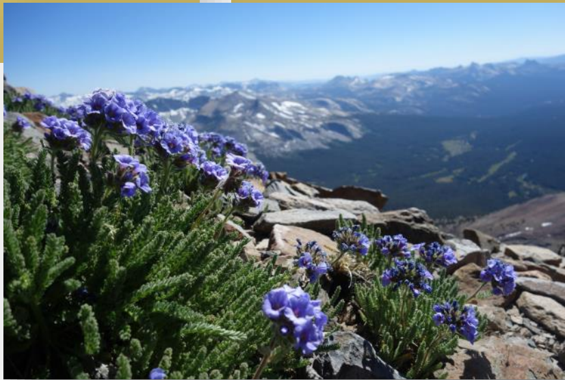
Sky pilot ( Polemonium eximium ), Mt. Dana Field Trip.