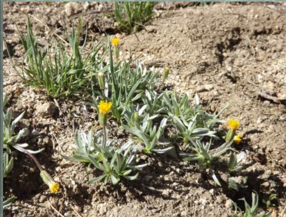
Silky raillardella ( Raillardella argentea ). Kinney Lake Field Trip.